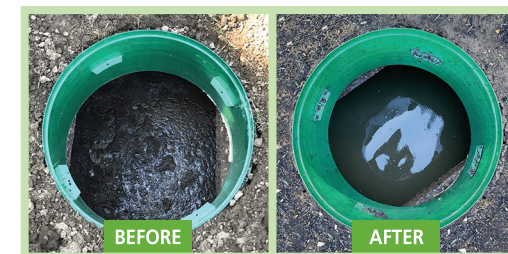
Aerobic Septic System After 4 Weeks