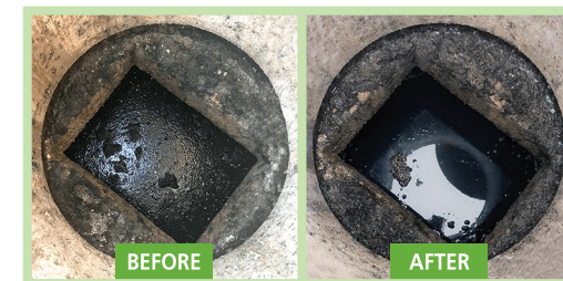
Traditional Septic System After 4 Weeks