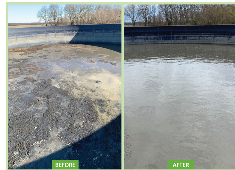
4-Month Before & After Treatment 1.5 Million Gallon Storage Area (Limestone, IL)

SEE THE DIFFERENCE FOR YOURSELF HIGHLY CONCENTRATED | INDUSTRIAL GRADE | TOP QUALITY | ALL NATURAL | ECO-FRIENDLY